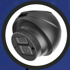
DRIVER VIEWING CAMERA