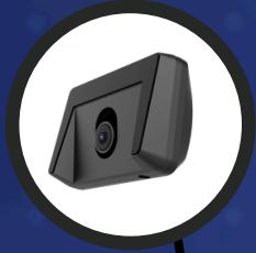
FORWARD FACING CAMERA